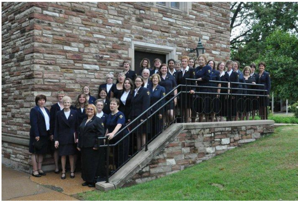
Some of the 39 CDC members who processed at the installation of synodical officers on September 11, 2010 at St. Timothy and St. Titus Chapel, Concordia Seminary, St. Louis, Missouri.

Para recibir y disfrutar de sus dones Para compartir su amor y misericordia Para ser lo que Dios nos hace Para descansar en su cuidado Para explorar su revelación Ser testigo de su bondad Para mantenerse firme Para ser audaz y valiente Para huir del Diablo Para ser perdonado y perdonar Para ser sanado A la espera de su venida Para llevar nuestra cruz y seguirlo Para ser su propia y viven bajo Él en su reino, ahora y para siempre. Amén.