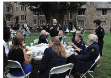
Ladies at the reception.

Concordia Publishing House joined in celebration, as September 11 th was the 141 st birthday of our synod's publishing arm.